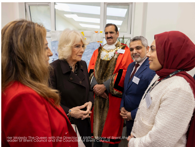
Her Majesty The Queen with the Director of AWRC, Mayor of Brent, the Leader of Brent Council and the Councillor of Brent Council

Take a look at the impact of our efforts, from the number of women we supported in 2024-2025 to the professionals we trained.