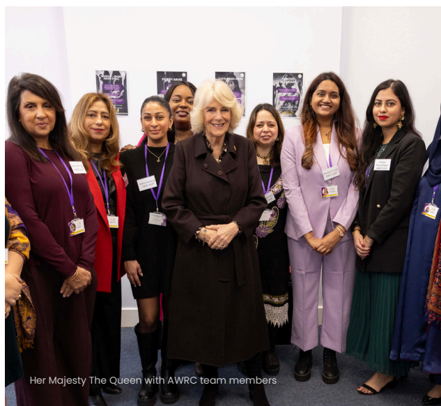
Her Majesty The Queen with AWRC team members